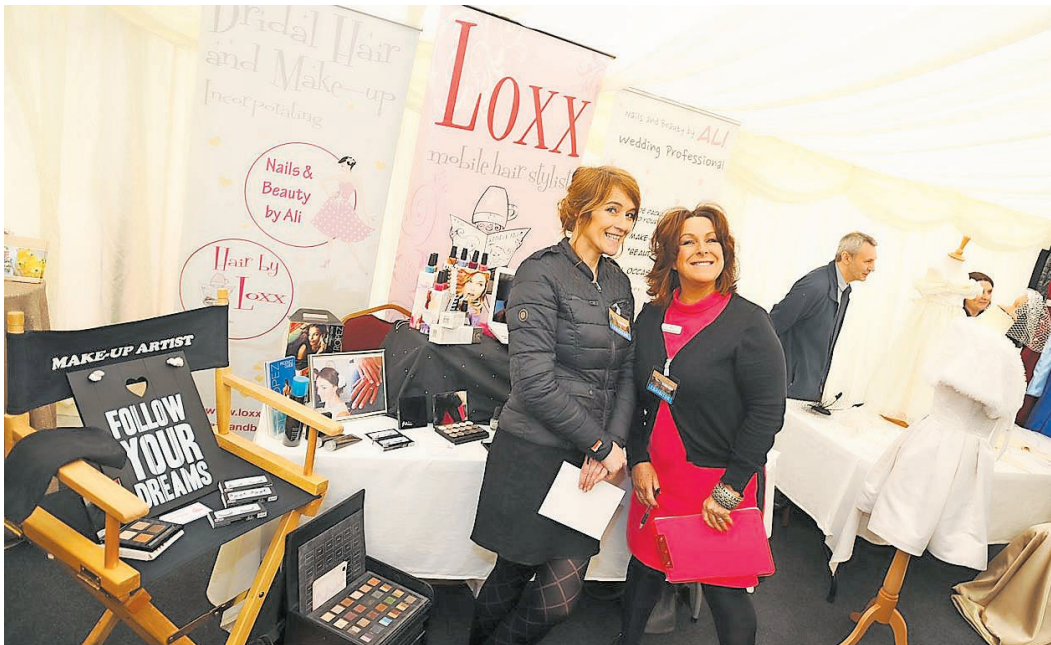
■ Loxx hair styling and Nails & Beauty.