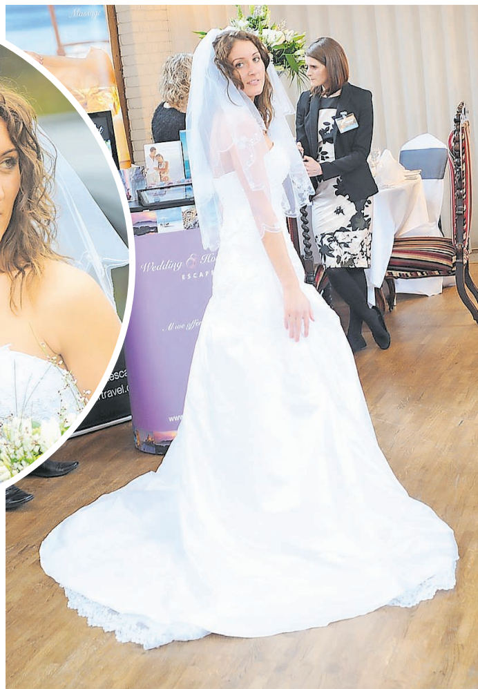
■ Beautiful gowns for the blushing bride.