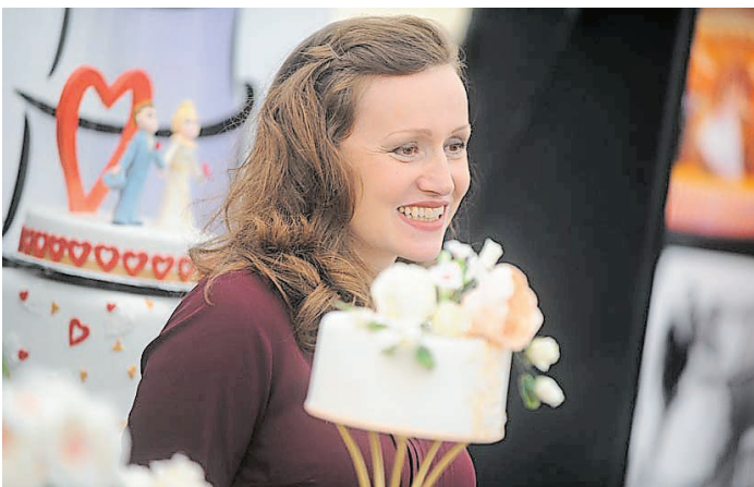
■ Happy faces at Seckford Hall.