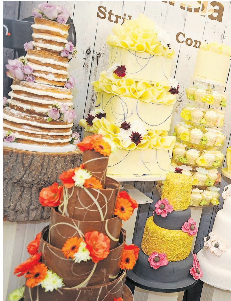
■ Cakes galore of all designs and tastes.