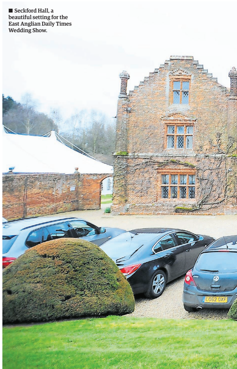
■ Seckford Hall, a beautiful setting for the East Anglian Daily Times Wedding Show.