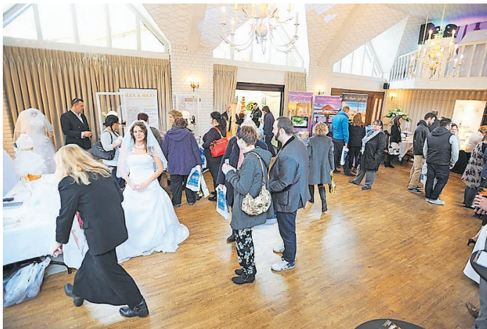
■ The East Anglian Daily Times Wedding Show at Seckford Hall.

It had everything that happy couples could ever need for their big day. VICTORIA RICHMAN reports on the East Anglian Daily Times Wedding Show at Seckford Hall Hotel