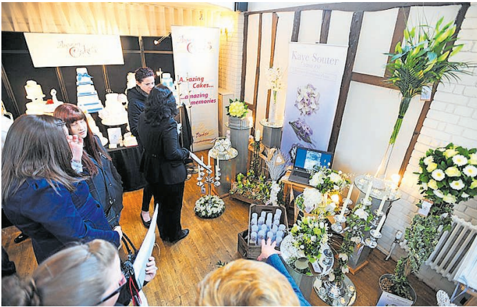
■ Brides and grooms-to-be get inspiration from the wedding show.