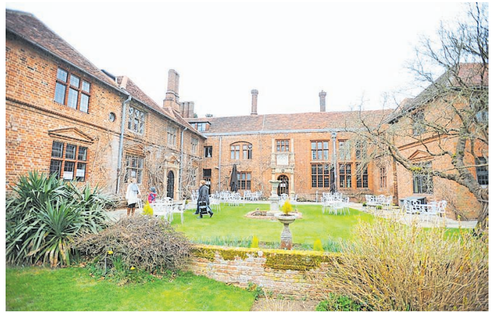
■ Stunning gardens at Seckford Hall.