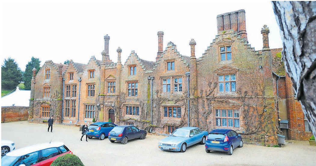
■ A stunning setting for a wedding at Seckford Hall.