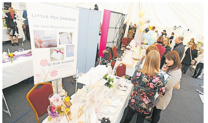
■ Little Pea Designs.