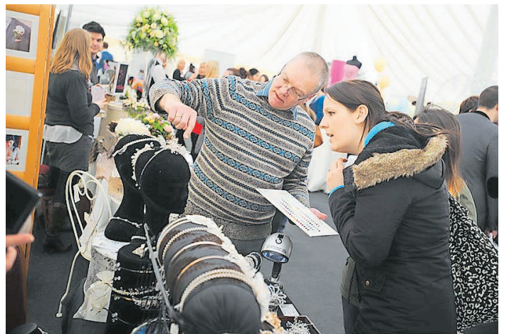
■ Beautiful tiaras and jewellery for brides and bridesmaids.