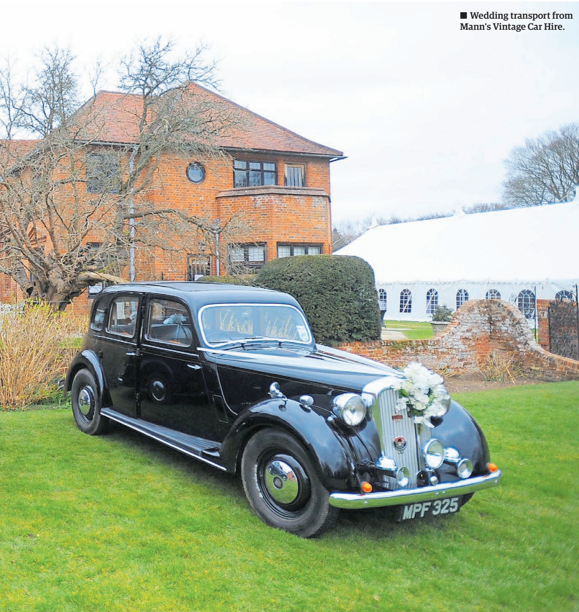
■ Wedding transport from Mann's Vintage Car Hire.